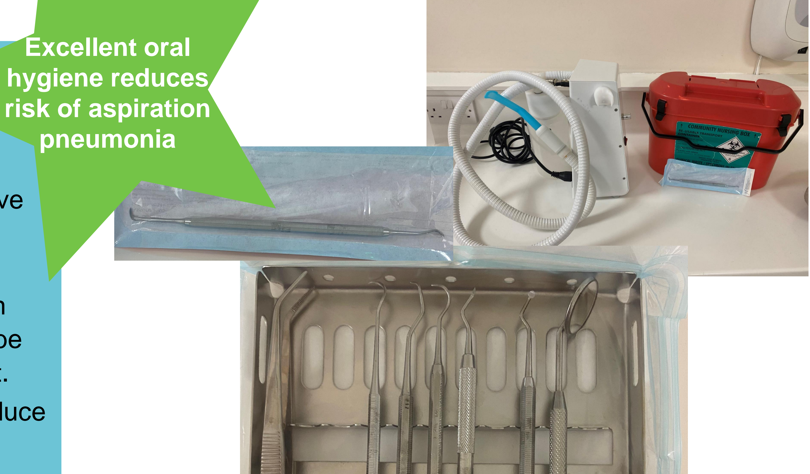
Figure 2. Photographs of equipment. (A) Mitchell's Trimmer. (B) Portable suction and clinical waste. (C) Hand Scalers.