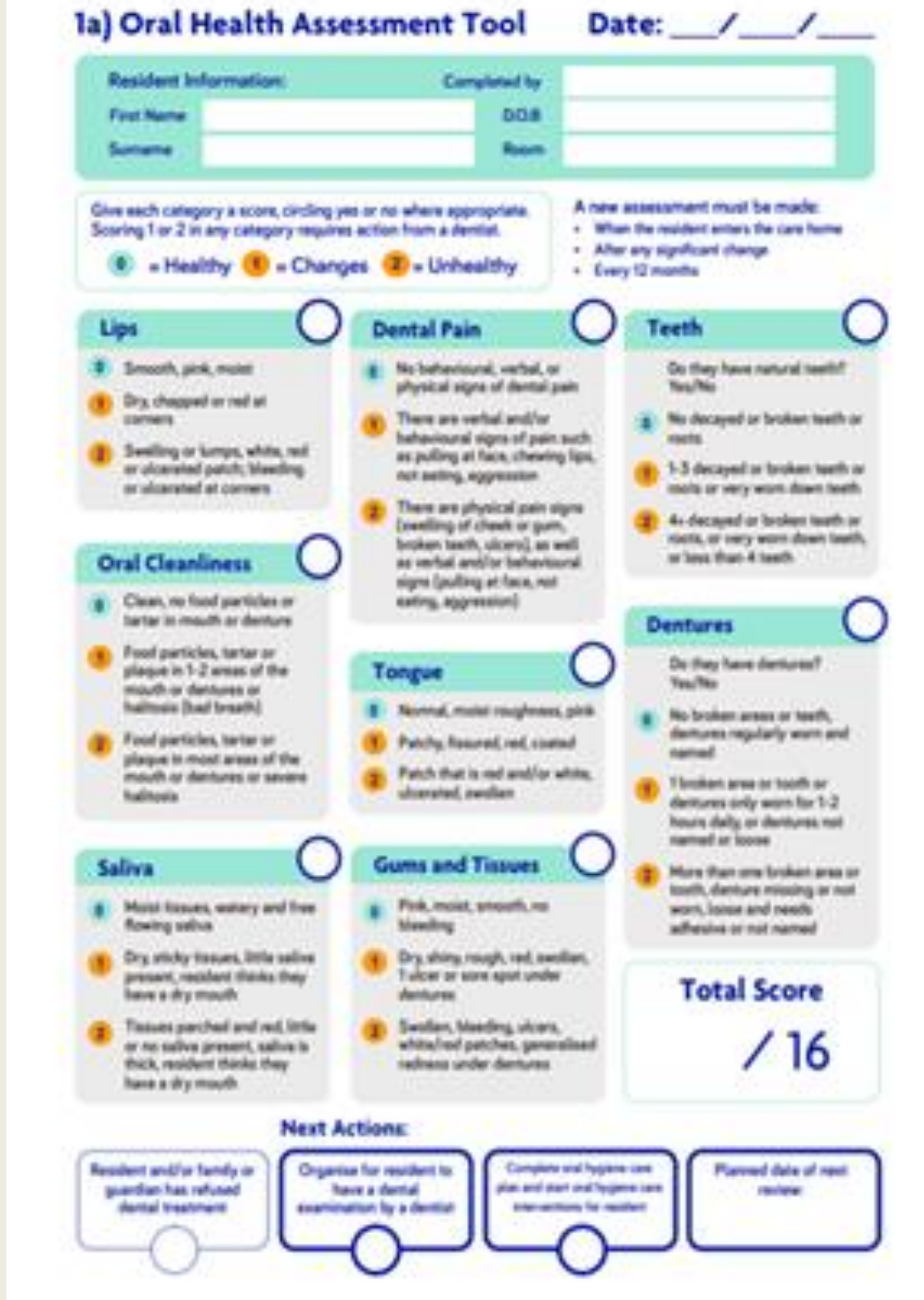
Fig. 2: TOPIC Oral Health Assessment Tool Communication Communication 9) Smile 11) Avoid Baby Talk

The oral health interventions in TOPIC will be delivered by non-dental care home staff. In order to facilitate this process a PowerPoint presentation was developed covering the details of the study and explaining the role of the non-dental team in data collection, oral health screening and maintenance. Staff were provided with an "Oral Health Assessment Tool", a "Personal Oral Care Plan" proforma, an "Oral Health Poster". "Tips and Tricks" cards and a "Weekly Oral Hygiene Record" form for residents. An instructional video was also produced by the research team on how to carry out screening and best provide oral care.