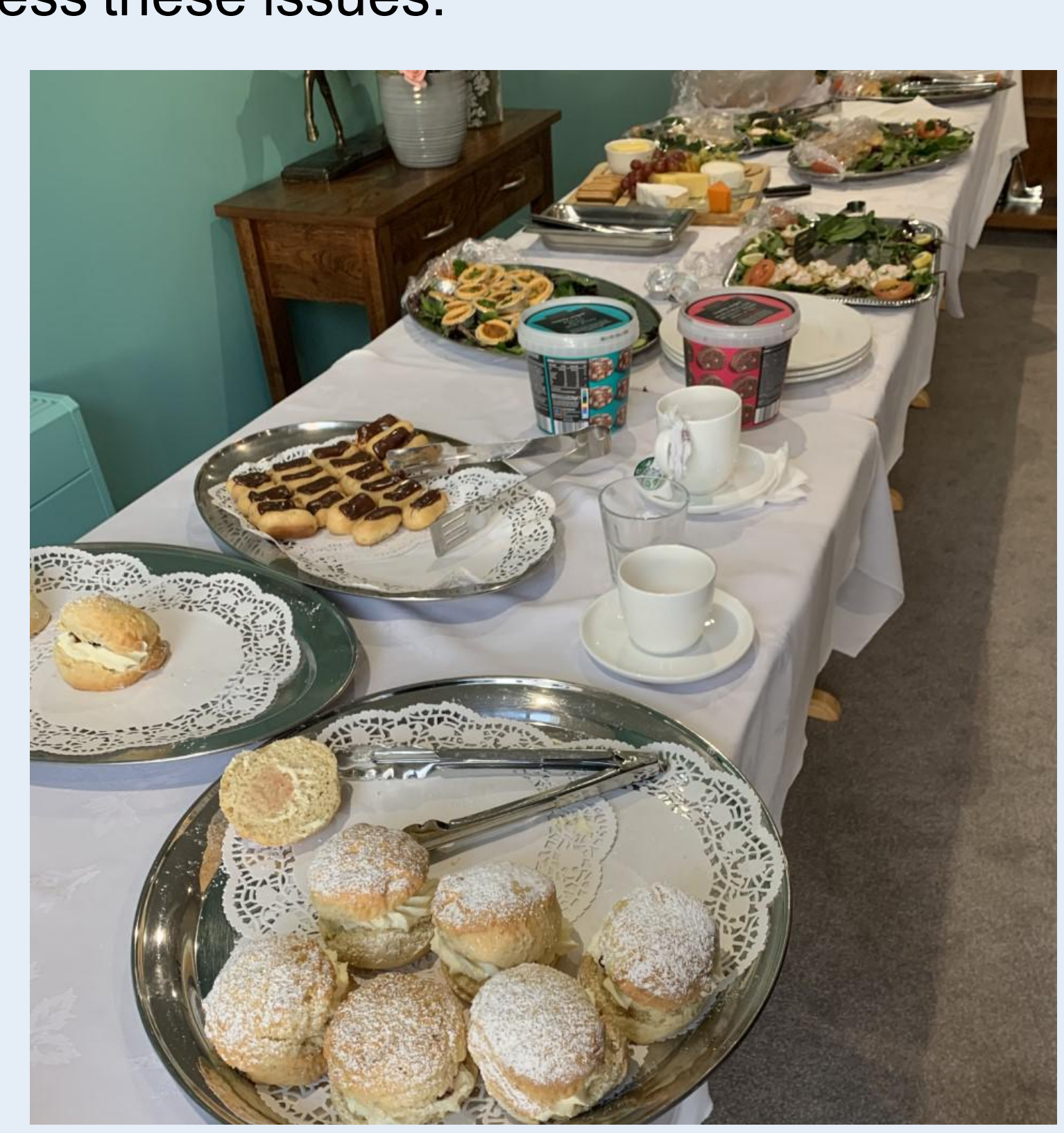
Figure 2. A 'pre-Covid' care home forum meeting.